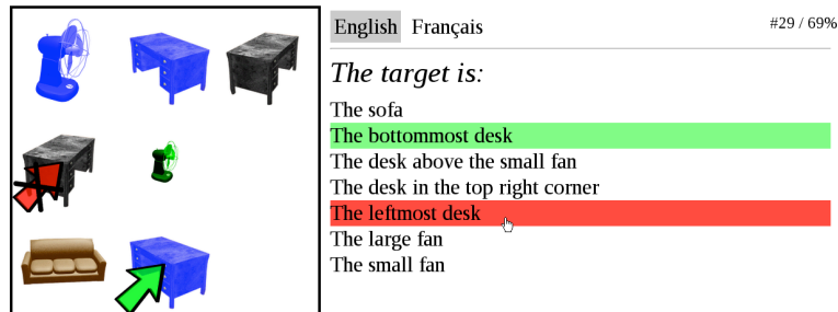
Fig. 4. The learner must click on the RE on the right corresponding to the target pointed at by the arrow. If ever the user made a mistake, the system displays the right answer in green (both the RE and the object), while highlighting in red the RE selected by user and the corresponding entity.

The system has generated a scene, selected a target and produced a Referring Expression (RE) for each entity of the scene. It is your task to find out which of these descriptions describes the target object. To show your decision click on the RE that designates the target.