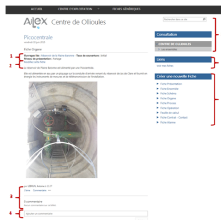
Figure 2: View page of a content form.

Several pieces of information were proposed as representative of reflexive indicators: notifications of new publications, authors and date of submission, last sheets read, view of contribution status, number of comments received on a sheet. The view of publications and number of comments did not trigger any discussion as they have been already discussed in previous sessions (see Figure 2 zone 3,4). Notifications of new contributions published or consulted were mentioned to facilitate the identification of recent information and the interests of other collaborators. The identification of the actors, such as the last contributor or the last reader, was deemed useful for initiating direct discussions between colleagues. However, the identification of the successive contributors was not considered necessary, a validated form being considered as a collective work. The status of publications (pending, rejected, and accepted) has emerged due to the expressed need to know if and when the validator has taken into account a contribution. Finally, by considering possible use cases, the discussions revealed two ways of presenting these indicators: in a personal page linked to profiles (see Figure 2 zone 6 for access) and on COs front pages. The first page was seen as a way for each collaborator to follow his / her