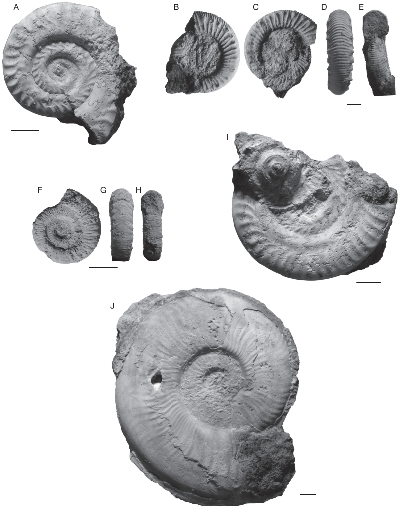
FIG. 4. — A , Hildoceras sublevisoni Fucini, 1919 (UBGD 279080, Sublevisoni Subzone, Airvault); B-H , Porpoceras gr. vortex (Simpson, 1855) - verticosum Buckman, 1914 ( B-E , UBGD 279078, Bifrons Horizon, Airvault; F-H , UBGD 279079, Bifrons Horizon, Airvault); I , Hildoceras bifrons (Bruguière, 1789) (UBGD 279081), Bifrons Horizon, Airvault); J , Haugia variabilis (d'Orbigny, 1844) (UBGD 279082), Variabilis subzone, Airvault). Scale bars: 10 mm.