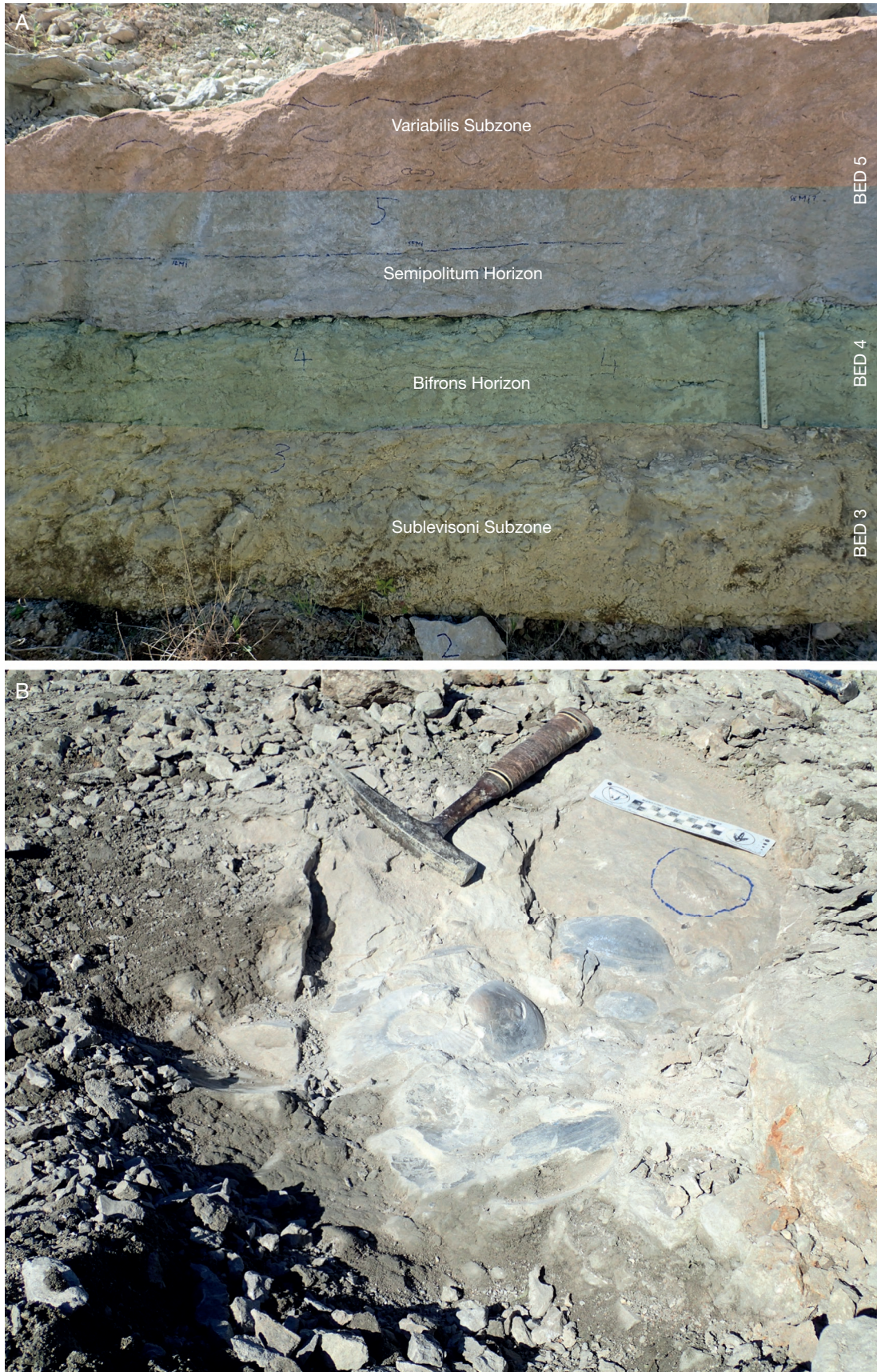
FIG. 3. — A , Stratigraphic succession of Middle Toarcian beds in the Airvault quarry; B , close-up view of the upper part of the Variabilis subzone in the Airvault quarry, with a Porpoceras specimen (UBGD 279076, see Fig. 5A) in situ indicated with a circle.