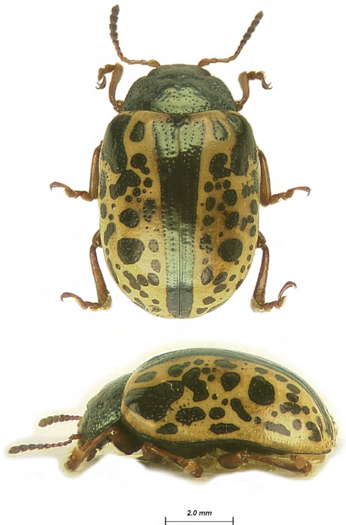
Figures 2 and 3. Calligrapha pantherina . 2: Dorsal habitus. 3: Lateral view (S. Cazères).

Koumac (Paagoumène), Tiébaghi (Société Le Nickel bureau, Creek-à-Paul Region), alt. 15 m, 20.485857, 164.193886, leg. H. Jourdan,