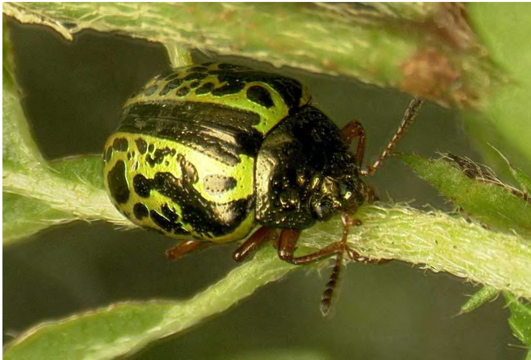
Figure 1. Living specimen of Calligrapha pantherina on its host plant.

from Fiji (Bule 2009). In Vanuatu, it was first released on Efate Island, but released and found in 2006 on Espiritu Santo (Jolivet et al. 2010a) and Mallicolo Island, and later on most of the archipelago.