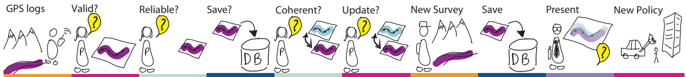
Figure 3. A simplified process diagram of participant P12. The coloured line under the sketch corresponds to the steps of the flow diagram analysis for that participant. Yellow bubbles represent the analysis steps affected by uncertainty information, as reported in our participant's scenario.

In the following sections we summarise active user strategies for coping with uncertainty at the data level, before discussing tacit coping strategies. We do not discuss active strategies relating to non-data levels as we do not have enough notes related to this aspect of analysis. For each strategy, we discuss key component tasks and relate them to the five analysis processes ( Acquire, Manipulate, Characterise, Reason, Present ), as well as uncertainty types and sources.