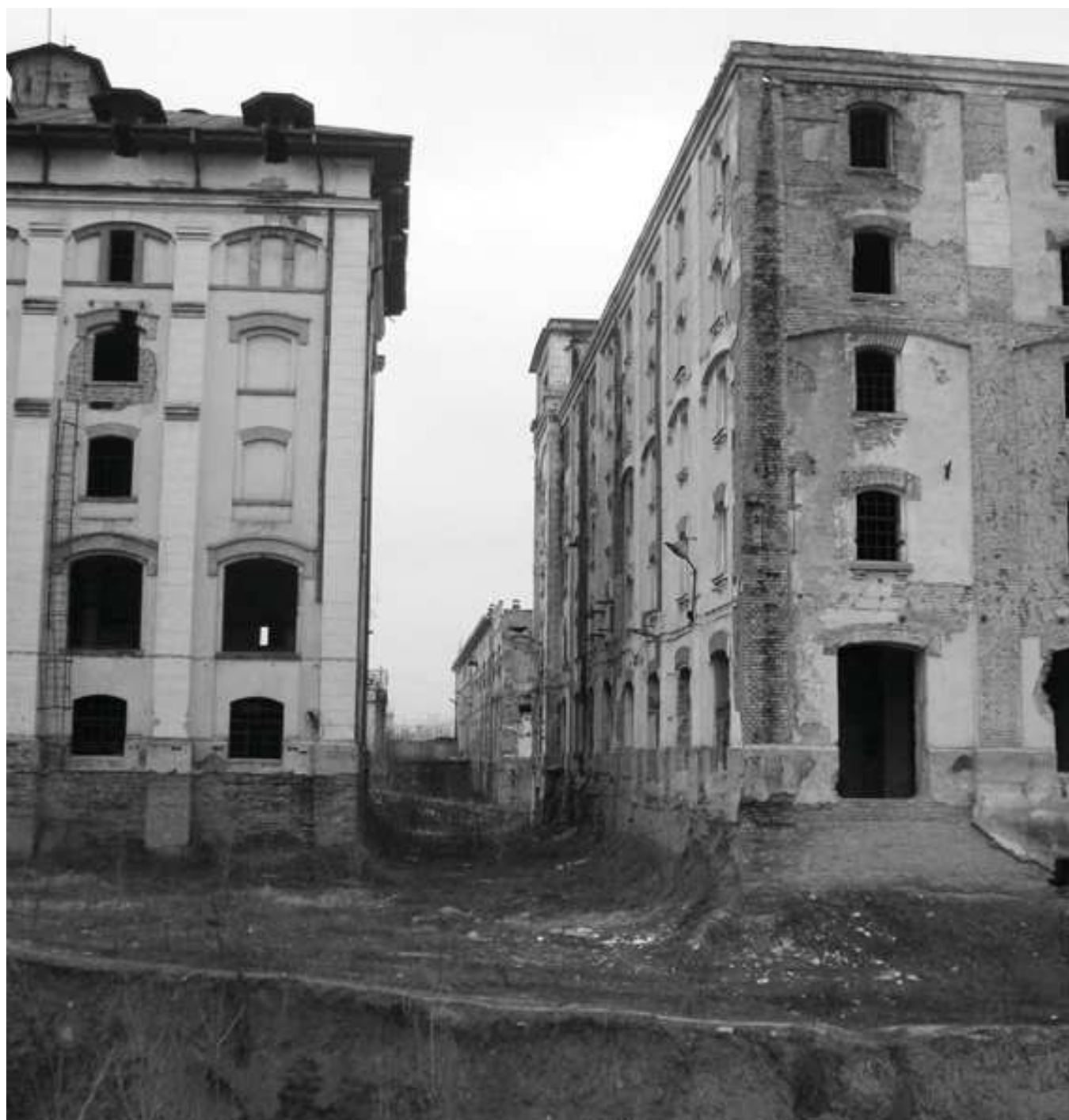
A.L. Pitulicu, Old beer factory , Fourth Edition Peoples Landscapes