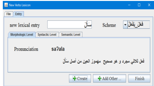
Fig. 3. New verb lexicon interface.

corresponding package). The second sub-module is for the adding of the lexical entry description in the lexicon file. In this part, ALIF editor connects to the rules and constraints files to generate a morphological description (derived and inflected forms) for each entry given by the user and according to its properties (scheme and category). Besides, ALIF editor offers the choice for the user to create lexicon by adding the canonical entries one by one or all of them in an external text file. For the example of a verb lexicon, Fig. 3 illustrates the interface to create new verb lexicon.