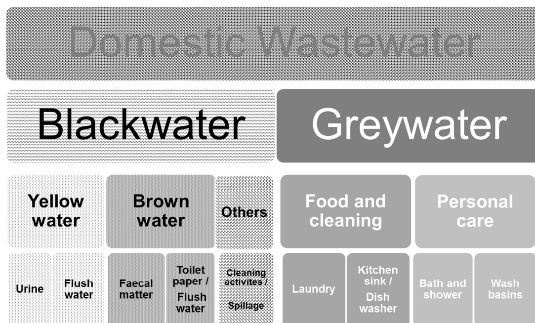
Figure 1. Classification of domestic wastewater

The characterization of domestic wastewater by emission source implies differentiating all source locations where wastewater is produced at household scale.