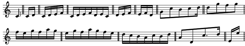
Fig. 3 The motif classes that appear in the motif division of J.S. Bach's Invention No. 1 (the number of motif classes was set at 13.).

The 12th motif class is a very characteristic one that includes a dotted note and a large leap. This motif class only appears before the cadence domains (the two motifs surrounded by the rounded rectangle). We can consider that this remarkable motif class plays an important role that tells listeners the end of the exposition of subject and the beginning of the cadence domain.