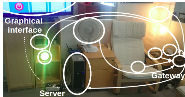
Fig. 1. The connected apartment inside ADREAM

The automation of the home, or domotics, is a domain of the IoT with direct impact on citizens. At LAAS-CNRS, the ADREAM project 6 aims at conducting research thanks to an instrumented, energy-positive building. This building is equipped with more than 4500 sensing devices, producing up to 500,000 measures a day. Inside the building, there is a mock-up apartment equipped with commercial devices from diverse vendors. Deployed devices include sensors (temperature, luminosity, humidity, pressure), actuators (fan, space heater, diverse lamps), which communicate using different technologies (phidget, ethernet, zig-bee) with gateways connected to a central server (see fig. 1).