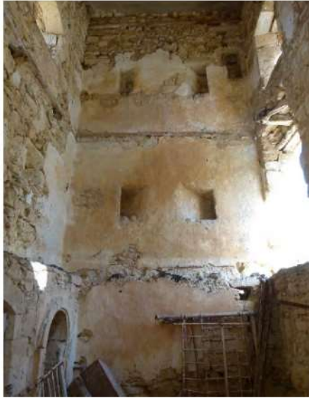
Fig. 9- Tower-house in Giannoudion, interior east elevation (section AA' in Fig. 8) (Emma Maglio, 2014).

The rectangular splays are irregular and somewhere curved, and the plaster prevents any further analysis (Fig. 9).