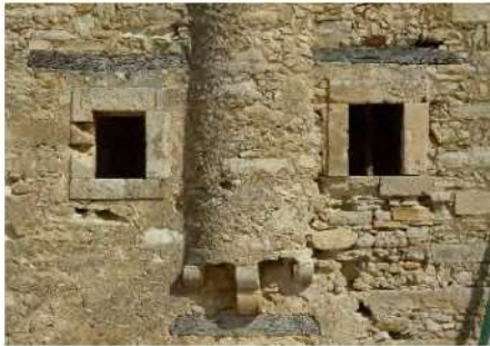
Fig. 7- Tower-house in Giannoudion, west elevation, detail (Emma Maglio, 2014).

different forms and kinds of blocks. In the west elevation, we find three small wooden beams over the discharging arches of the windows and below the fireplace (Fig. 7).