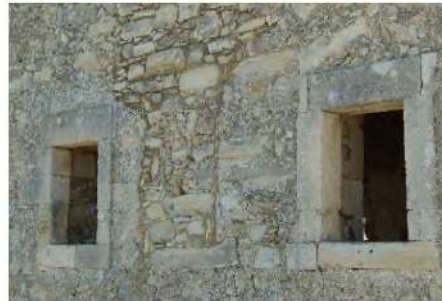
Fig. 10- Tower-house in Giannoudion, exterior North façade, detail (Emma Maglio, 2014).

are in the building. At the second level, the small window flanked by loopholes probably lighted up a warehouse and was also involved in the defense. At the third level there was the real mansion of the lord: we can see a fireplace made with sculpted blocks of white soft limestone. The couples of rectangular windows of the North and South fronts replaced former windows opened up at the center of the façades: one of the current windows reused a part of the jambs of the former window, and we can see traces of reparations in the masonry (Fig. 10, 11).