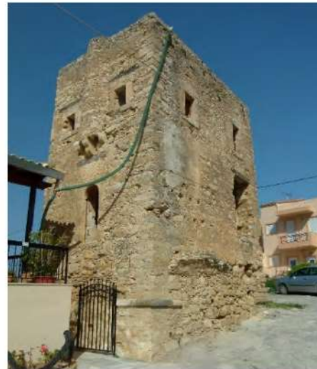
Fig. 6- Tower-house in Giannoudion, west and South elevations (Emma Maglio, 2014).

vault suggests the presence of a horizontal connection with the adjacent ruins. Perhaps a larger complex was situated around the tower, also including a second ruined barrel-vaulted structure that stands to the east of the tower.