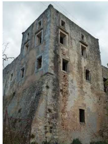
Fig.3- Tower-house in Mikro Metochi (Emma Maglio, 2014).