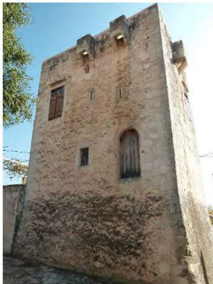
Fig.2- Tower-house in Mouzouras (Emma Maglio, 2014).

The aligned windows and the decorated frames prove the existence of a specific project, and perhaps of more skilled workers.