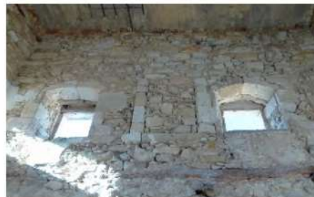
Fig. 11- Tower-house in Giannoudion, interior North façade, detail.

All these windows are rectangular, but the interior lintel blocks on the North elevation have an angled form: this can be frequently found in rural houses of the island. A second type of windows is on the west elevation: two quadrangular openings flanking the fireplace make up a homogeneous whole with it (this is confirmed by the presence of wooden lintels), probably contemporary to the windows placed at the same level on the other façades.