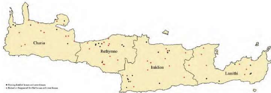
Fig. 1- Identified sites of fortified houses (Emma Maglio, 2015).

34 are in good conditions. Tower-houses are the most common typology: 30 edifices are ruined or disappeared, and 27 survive (Fig 1).