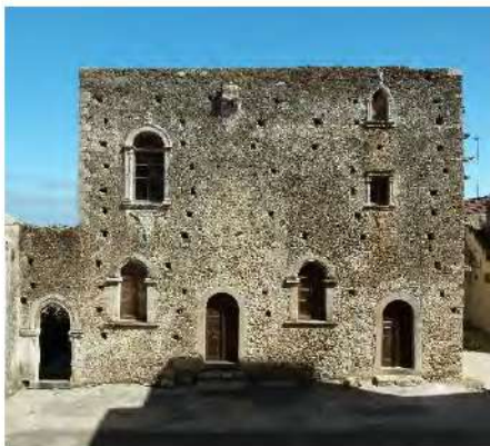
Fig. 4- Fortified house in Roghdia (Emma Maglio, 2014).

In the same prefecture is the village of Maroulas, where four towers survive, some of them restored and others currently abandoned. One of the rare fortified “palatial” houses of Crete, instead, belonged to the Venetian Modino’s family in the village of Roghdia, where it dominates the Iraklion bay (Fig. 4). It dates back to the 16 th c. and was restored by the Ephorate. The building consists of three floors and has its original access at the first one; some arched openings were added, but the presence of loopholes and bretèches proves a defensive use. In the prefecture of Lassithi, several ruined tower-houses are in several villages deserted found starting from the 14 th c. in the Venetian cadastres. Among them, the tower of the Venetian Zenone’s family dates back to the early 18 th c.: it survives until the first floors, where there is a stone fireplace.