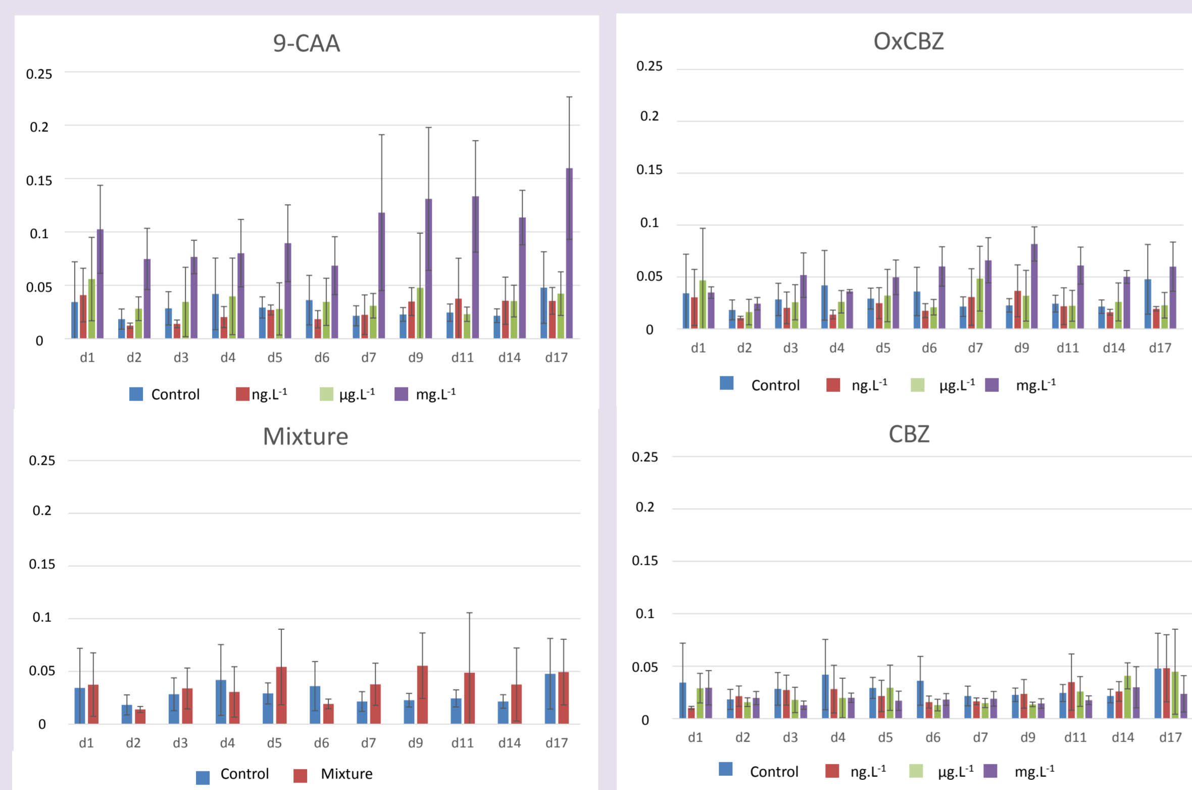
Phenolic index of compounds and control during a 17 day-long exposure