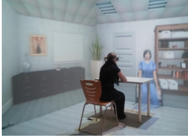
Fig. 2: Virtual reality environment for training

The virtual patient has been integrated in the CRVM (Centre de Réalité Virtuelle de