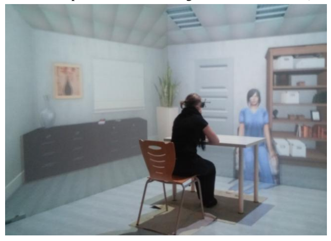
Fig. 2: Virtual reality environment for training

The virtual patient has been integrated in the CRVM (Centre de Réalité Virtuelle de