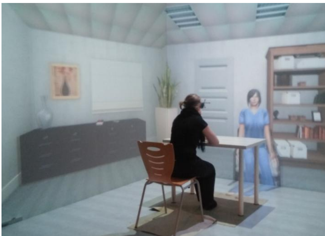
Figure 2: Virtual reality environment for training doctors to break bad news

taking) and at non-verbal levels (e.g. feedback, gaze, gestures, etc.).