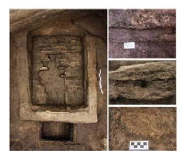
Figure 5. Leaching pit n.1 with accompanying views of the detail

Five leaching pits (LK1–5) share the same basic elements: a rectangular semi-subterranean pit built and lined with impermeable clay; wooden sticks laid across the bottom provide support for a filter comprised of a pierced wooden board, reeds and charcoal; a channel running through the centre of this shallow pit drains into a deeper rectangular one; the opening of this latter pit is protected by a wooden frame and is lined with wooden boards on the sides and a mat at the base (Figure 5). This rectangular pit receives brine from the filtration process, which is later boiled to obtain salt.