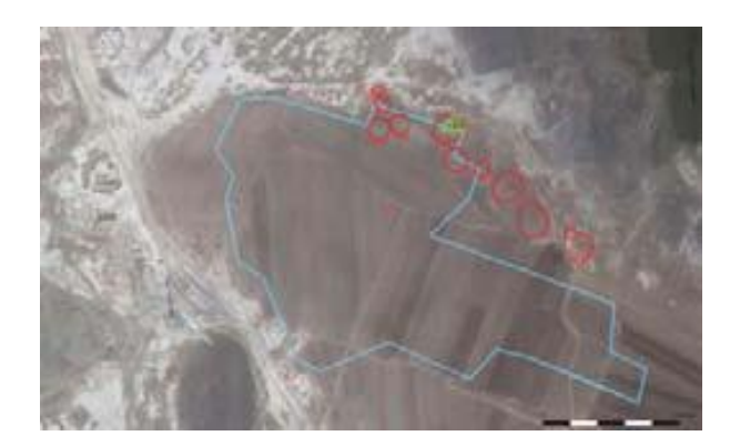
Figure 2. Satellite photograph of Yinjiawopu, with the site boundaries determined by the survey shown in blue, the mounds measured with RTK in red, and the excavated area shown in green.

Today, the area surrounds a shallow body of water and as such has a high water table; it is also subject to evaporation and dramatic erosion. Thus, the soluble salts in the soil rise by capillary action and accumulate on the surface. Although salinisation is a dangerous desertification process, people still choose to settle in this region (Figure 3).