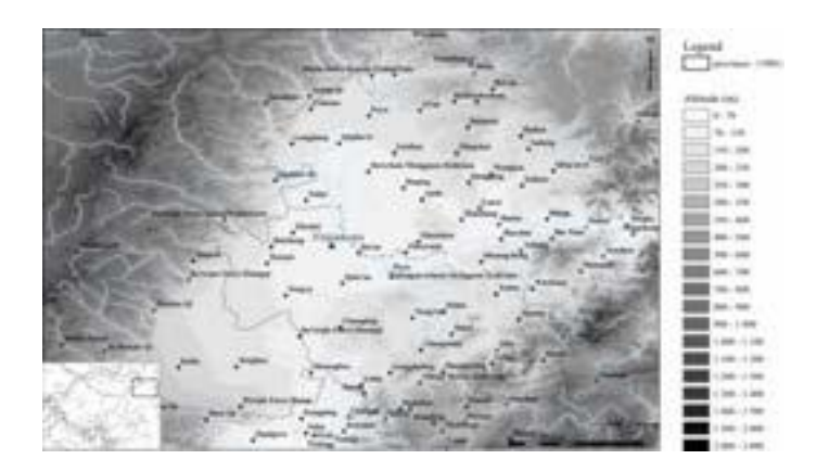
Figure 1. Map of the Manchuria Plain, showing the location of the Yinjiawopu site.

The heart of the Manchuria Plain is currently undergoing a dramatic desertification process. The environment is a patchwork of alkaline soil, cultivation zones and ancient marshes and lakes. Research on its past is vital for understanding both the ancient exploitation of marginal environments and the practices that are shaping the modern landscape (Figure 1).