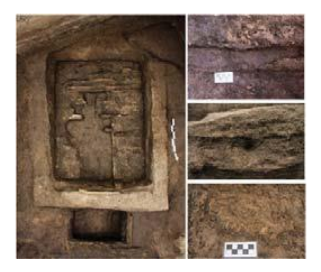
Figure 5. Leaching pit n.1 with accompanying views of the detail

Five leaching pits (LK1–5) share the same basic elements: a rectangular semi-subterranean pit built and lined with impermeable clay; wooden sticks laid across the bottom provide support for a filter comprised of a pierced wooden board, reeds and charcoal; a channel running through the centre of this shallow pit drains into a deeper rectangular one; the opening of this latter pit is protected by a wooden frame and is lined with wooden boards on the sides and a mat at the base (Figure 5). This rectangular pit receives brine from the filtration process, which is later boiled to obtain salt.