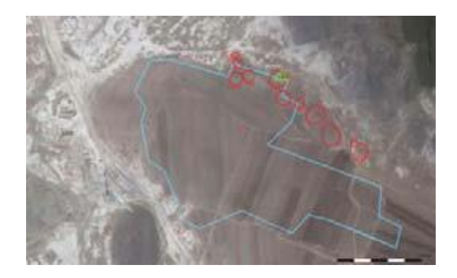
Figure 2. Satellite photograph of Yinjiawopu, with the site boundaries determined by the survey shown in blue, the mounds measured with RTK in red, and the excavated area shown in green.

Today, the area surrounds a shallow body of water and as such has a high water table; it is also subject to evaporation and dramatic erosion. Thus, the soluble salts in the soil rise by capillary action and accumulate on the surface. Although salinisation is a dangerous desertification process, people still choose to settle in this region (Figure 3).