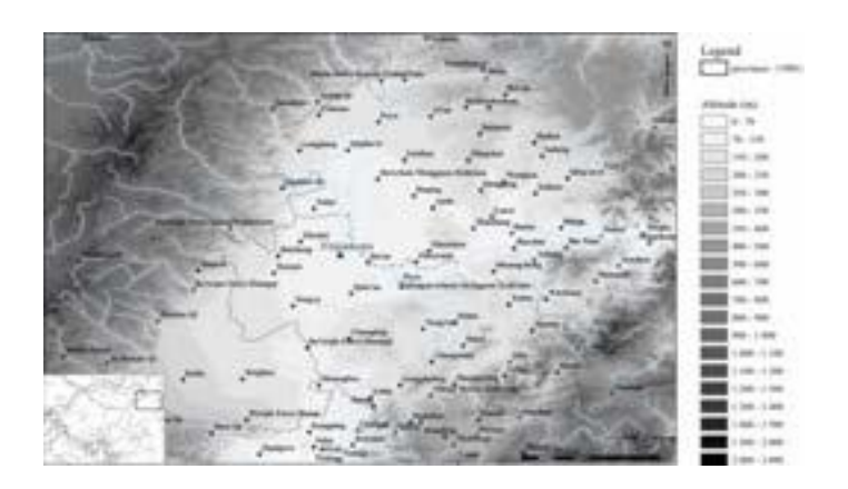
Figure 1. Map of the Manchuria Plain, showing the location of the Yinjiawopu site.

The heart of the Manchuria Plain is currently undergoing a dramatic desertification process. The environment is a patchwork of alkaline soil, cultivation zones and ancient marshes and lakes. Research on its past is vital for understanding both the ancient exploitation of marginal environments and the practices that are shaping the modern landscape (Figure 1).