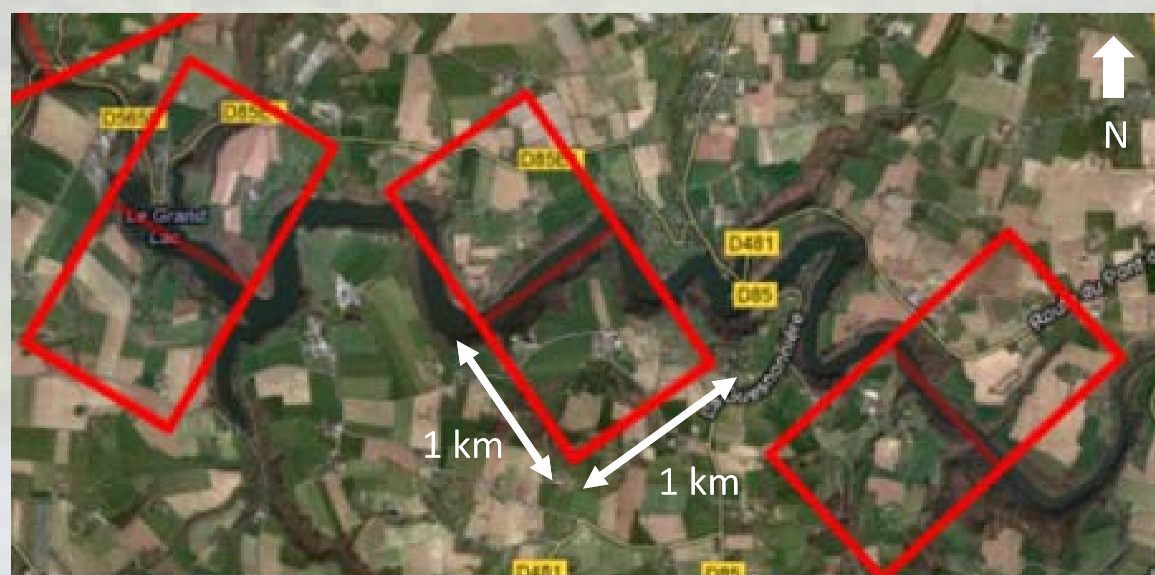
The three landscapes are replicates. They are centered on the Sélune river.