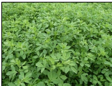
Figure 2. A stand of the alfalfa crop at the stage of full vegetative development

On-farm barn drying is an emerging technique in some European regions, especially where high-quality products, such as protected-designation-of-origin cheeses, are produced. Alfalfa is extremely well adapted for such a production system, as it dries more quickly than other forages in the drying cells under ventilation.