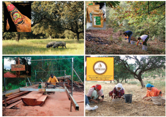
Fig. 3. Sustainable development initiatives in rural forests: Geographical Indication for rural forest products (pork meat in the Spanish dehesa : above left, chestnut flour in Corsica: above right, argan oil in Morocco: below right) or Community Forestry in Cameroon (below left)

Drawing on long-term research experiences in France, Morocco, Southeast Asia, and Africa on forests managed by “farmers” (shifting cultivators, settled farmers, and/or seminomadic shepherds), and following authors in these specific fields, we elaborate on concepts for a better understanding of the specific relationships that have evolved between rural people and forests, ecosystems and landscapes. We then engage in a critical review of how forest-related and sustainable development policies consider forests, in general, and discuss how they address (or do not address) the specificity of rural forests and encourage (or do not encourage) their development.