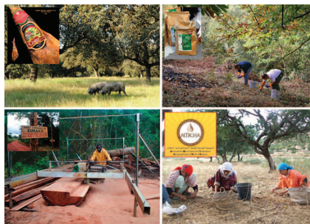
Fig. 3. Sustainable development initiatives in rural forests: Geographical Indication for rural forest products (pork meat in the Spanish dehesa : above left, chestnut flour in Corsica: above right, argan oil in Morocco: below right) or Community Forestry in Cameroon (below left)

Drawing on long-term research experiences in France, Morocco, Southeast Asia, and Africa on forests managed by “farmers” (shifting cultivators, settled farmers, and/or seminomadic shepherds), and following authors in these specific fields, we elaborate on concepts for a better understanding of the specific relationships that have evolved between rural people and forests, ecosystems and landscapes. We then engage in a critical review of how forest-related and sustainable development policies consider forests, in general, and discuss how they address (or do not address) the specificity of rural forests and encourage (or do not encourage) their development.