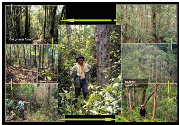
Fig. 5. Fostered silvigenetic development processes in the establishment of Benzoin Agroforest in North Sumatra, Indonesia: farmers introduce benzoin seedlings in the cleared undergrowth of old-growth forest, let it grow with self-established species, then clear the agroforest for regular harvesting for 40 to 60 years, and let the ageing agroforest revert to an old-growth forest for a new planting cycle

Another significant example of forest ecosystem domestication is the high level of both genetic and specific diversity of oaks in the fragmented forests of French Gascony, resulting from multifunctional forest management practices