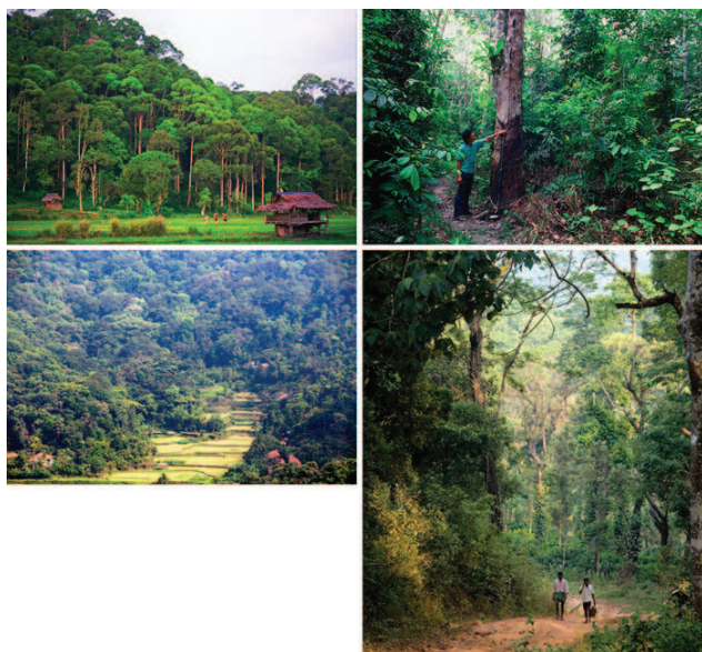
Fig. 2. Rural forests: Agroforests in Indonesia (above) with damar ( Shorea javanica ) (left) and rubber ( Hevea brasiliensis ) (right), Agroforests in India with coffee (below)

Precisely because of (or despite) that, rural forests constitute highly resilient social-ecological systems. For centuries, rural forests have resisted national forestry frameworks that have tried to limit local forest-related practices and expel farmers from the forest. Rural forests have survived agricultural intensification and modernization that have attempted to eliminate trees from agricultural landscapes in order to rationalize local production patterns. Today, in many places in the world, outmigration from rural areas and related transformation of rural lands favor their extension or rejuvenation. These forests therefore constitute a good entry point for understanding the role public policies play in the resilience of social-ecological systems and how they may encourage or discourage a path towards sustainability.