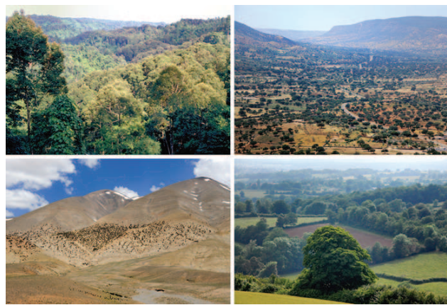
Fig. 7. Landscape domestication patterns in rural forest systems: from continuous forest cover (above) in the damar agroforest in Indonesia (left) and in the argan forest in southwestern Morocco (right) to forest fragments (forest “ agdal ” in the Moroccan High Atlas: below, left, and linear forests and woodlots in Central France: below right)

As developed elsewhere, forest domestication also includes a strong immaterial component that relates a particular forest (and its components, from trees to landscapes) to a human group, its history and its domestic units (Michon et al. 2007).