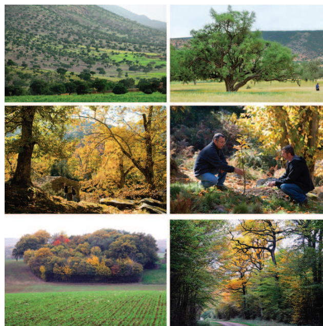
Fig. 1. Rural forests: Argan forest in Morocco (above), chestnut forest in Corsica (middle), farmers’ forest in France (below)

The resulting “rural forests” appear as somewhat distinct from conventional forests; they exhibit common characteristics from North to South, though are rather contrasted as far as tree species, ecosystem structure, management practices or underlying institutions are concerned (G nin et al. 2013). The major distinction is that they are the product of planned farming and are attached to the domestic economies in the surrounding areas. But because they are forests, they are still often impacted at a national scale by forest policies and regulatory frameworks. These policies and associated forest management regimes are devised to manage forest domains in the name of the State but are not meant to incorporate the interests and logics of rural forests. They have therefore contributed to the concealment of the realities of rural forest management, led to global misinterpretation of its importance and characteristics, and impeded its development.