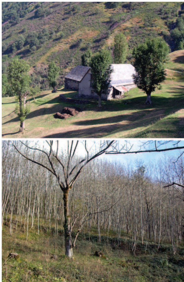
Fig. 8. The evolution of ashtree-based rural forests in the Pyrenees, from traditional stands around the farm (above) to dense thickets colonizing abandoned pastures (below)

Rural forests result from a continuous management process occurring simultaneously at local, national and international levels, which has to be analyzed in light of local societies' dynamics and interactions with the political arena (particularly in the areas where the influence of the state on forest management is important). These interactions differ historically and from one country to another but definitively impact the resilience of both rural forests and the production systems in which they are included. They include elements of ideology (from foresters' point of view, the historical equating between rural forests and "backwardness" of rural populations; from a local perspective, the perception local forest as a symbol of resistance to a centralized state), actor's behavior (domination, imposition, resistance, incorporation, training, collaboration), rules and measures (repressive or inciting).