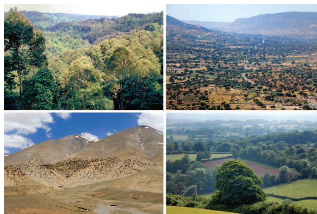
Fig. 7. Landscape domestication patterns in rural forest systems: from continuous forest cover (above) in the damar agroforest in Indonesia (left) and in the argan forest in southwestern Morocco (right) to forest fragments (forest “ agdal ” in the Moroccan High Atlas: below, left, and linear forests and woodlots in Central France: below right)

As developed elsewhere, forest domestication also includes a strong immaterial component that relates a particular forest (and its components, from trees to landscapes) to a human group, its history and its domestic units (Michon et al. 2007).