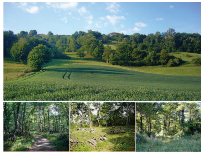
Fig. 6. Farmers' forests in French Gascogne: a fragmented forest-type in agricultural lands managed for firewood production, game hunting and mushroom collection, with high levels of biodiversity

The main characteristic of ecosystem domestication lies in the fluidity between what relates to human practices and what relates to nature. Contrary to the ecological oversimplification and strong control associated with modern agriculture or even tree culture and orchards, management practices foster desired productions while containing wilderness within acceptable limits. Michon (2011), for example, shows that the chestnut orchard exhibits a rather continuous back and forth movement between wild, managed and cultivated with a coevolution of practices and ecosystem structure. Management intensification fosters the establishment of chestnut stands, while reverting to wilderness allows the system to survive abandonment. Today, chestnut producers try to devise a new compromise between wild and domestic. Aumeeruddy-Thomas et al. (2012) show a similar process of balancing nature and culture in reinvesting in garrigues for truffle production in southern France.