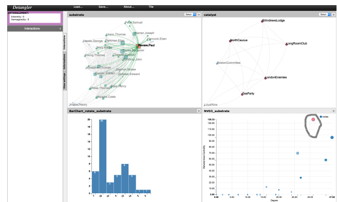
Figure 1: The multiplex social network of Paul Revere. The dashboard present 4 linked views of this dataset. We select Paul Revere by his high degree and centrality value, in the bottom right view. It shows on the top right view that he belongs to five of the seven societies, highlighted with red outlines. In the top left view Paul Revere is selected in red, and hovered so we can observe his direct neighborhood (in green).

These analytical tools allow Detangler to coordinate the visual exploration of a multiplex network. It proposes by default the presentation of two node-link diagrams. The first one presents the network of substrates , which is a "monoplex" projection of the multiplex network (same nodes and simple links), and the second one is the network of catalysts as in [10] (here, the social groups).