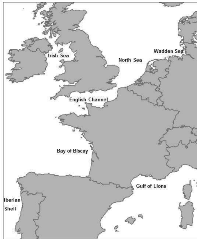
1 Figure 1