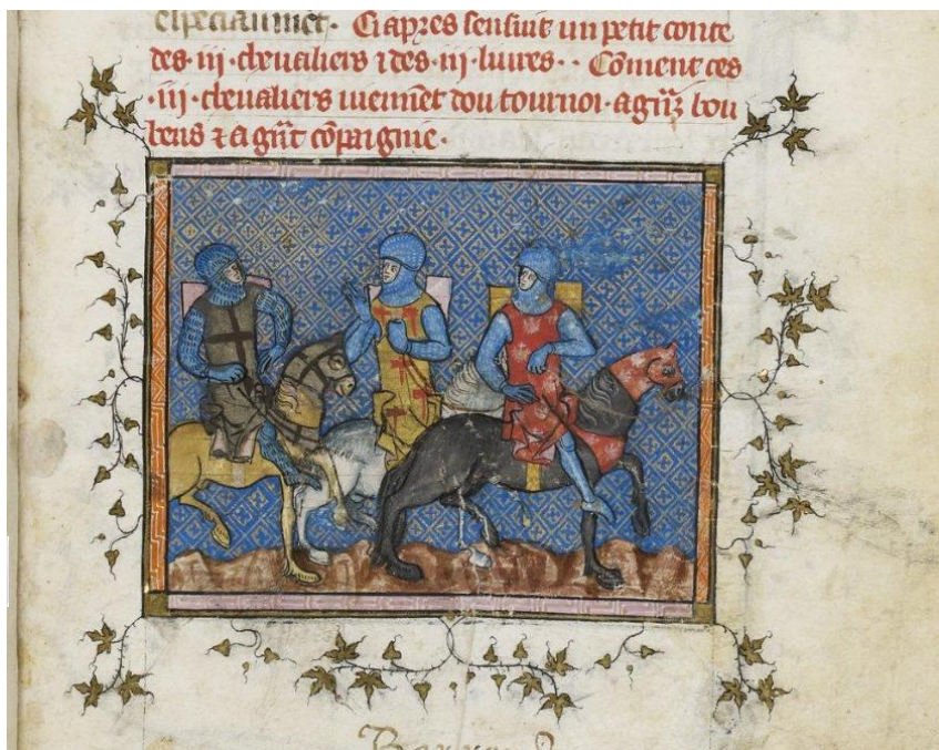
3. Three knights with the three colored books. Recueil de traités de dévotion en prose et en vers: Legiloque , 1325-1350. Paris, BnF, fr.4338, f.135r