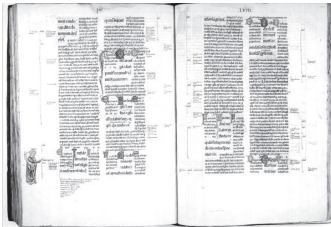
1. Psalter of Herbert of Bosham . Cambridge, Trinity College, Ms B.5.4, ff. 146v-147r.

of a book, mentally reconstructed by the reader with some features stressed with capital letters, incipits , and paragraphs, like physical manuscripts. 26