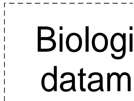
Figure 1: Data warehouse global architecture