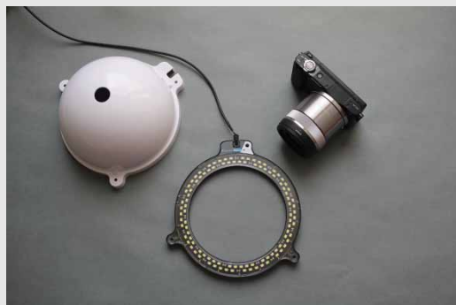
The dome, the ring, and the camera.