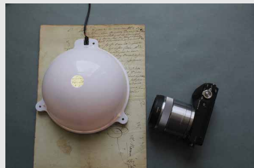
The dome can be directly placed on the object.