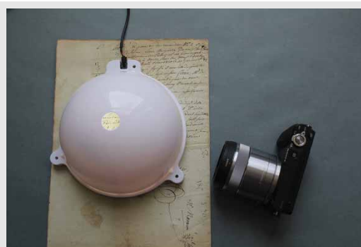
The dome can be directly placed on the object.