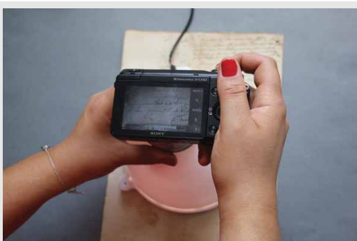
Align the camera with the aperture.