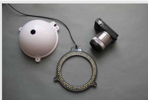
The dome, the ring, and the camera.