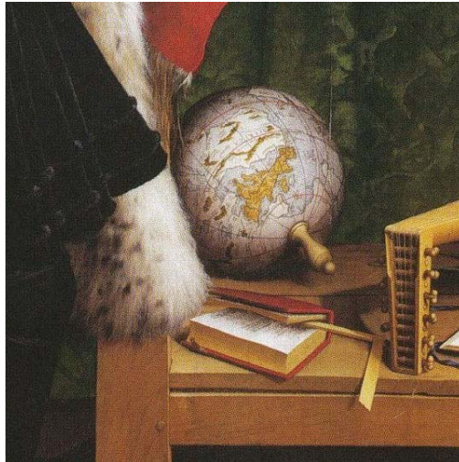
Fig. 5. Hans Holbein the Younger, The Ambassadors (1533) detail