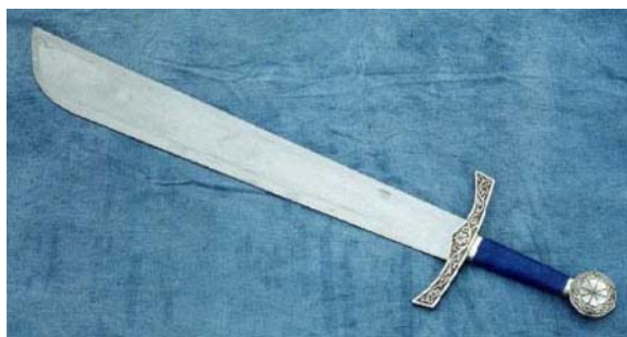
Fig.3. A falchion

props (a turban with a half-moon in it, a robe and a sword) handed out to the pirate Ward in his ‘Turk-turning’ ceremony shown in a dumbshow in Robert Daborne’s A Christian Turned Turk (1610), 15 or of another theatre-related visual document, namely the engraving on the title-page of the 1615 edition of Thomas Heywood’s The Four Prentices of London, with the Conquest of Jerusalem (1594). 16 The latter shows the four heroes wearing their Crusaders’ armours and tossing their pikes. Three out of four wear what seems to be a mix between the medieval falchion 17 and the scimitar, a detail (absent from the play itself) which medievalises as well as orientalisises the warring brothers’ portrayals.