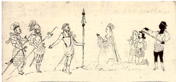
Fig.2. Peacham's drawing of Titus Andronicus

The scimitar is not mentioned elsewhere in the play, but it seems to have left a lasting impression on the mind of at least one famous contemporary viewer or reader of the play, i.e. the artist responsible for the drawing on the Longleat Manuscript, attributed to Henry Peacham and tentatively dated 1595. 10 Consciously or not, this composite drawing has been traditionally interpreted along the lines of an East-West divide, figured by Titus' spear or standard at the centre of it, which seems to symbolically separate Goths from Romans. Thus the two figures on the left are frequently seen as Roman guards or two of Titus' sons, while the two kneeling figures on the right-hand side are generally identified as Tamora's sons, Chiron and Demetrius. As for Aaron and his sword pointed at them, this element is usually interpreted as a conflation of the above-quoted scene, in which the