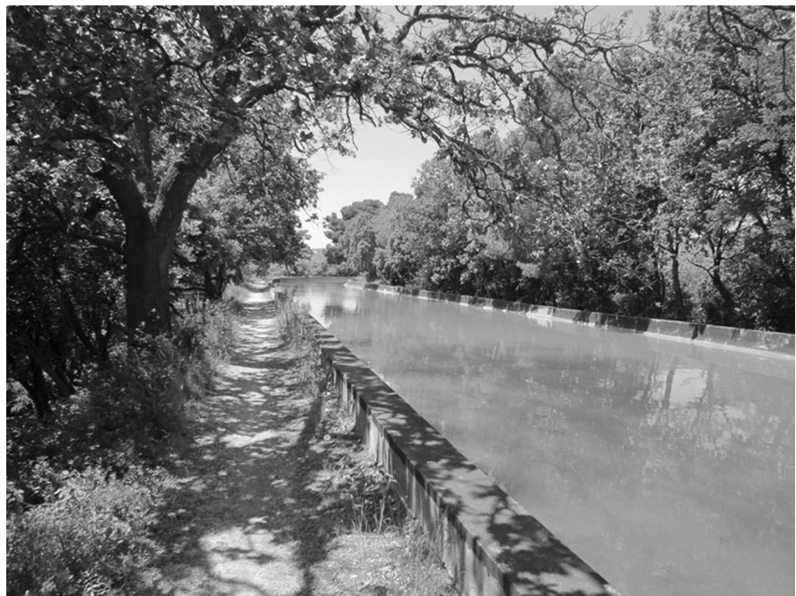
Fig. 2 A view of Marseille canal (Bouches-du-Rhône, France)

address two major challenges that Mediterranean societies will have to face: the scarcity of the resource and protection during increased periods of intense rainfall. The Mediterranean region will likely experience a rise in