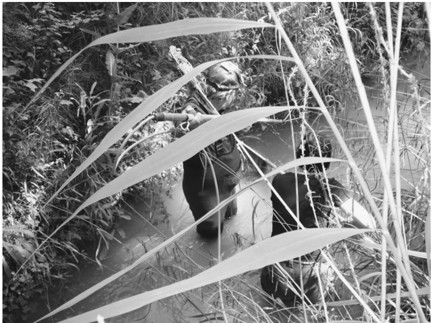
Fig. 3 Electric fishing in an irrigation canal (Vaucluse—France)

extinguish many freshwater fish species in future, by creating physical barriers to normal movements and migration of the biota and by decreasing habitat availability ” (Leadley et al. 2010).