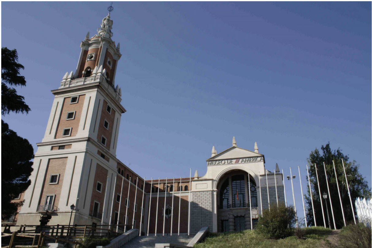
Figure 3: Museum of the Americas, Madrid

The new museum was inaugurated by General Franco on the 17 th of June 1965. Situated right next to the Victory arch, the Museo de América was part of the urban propagandistic programme of a regime, which defined itself as nacional-católico . Not surprisingly, the purpose-built museum designed by Luis Moya Blanco (1904–1990) and Luis Martínez-Feduchi Ruiz (1901–1975), was inspired by sixteenth century Spanish monastic architecture, stressing thus the role of Spain in the extension of Catholicism to the New World. The museum received the archaeological / anthropological collections from the National Archaeological Museum and the Museum of Anthropology ( Museo de Antropología ), but also a large number of artworks and handcrafts dating to the colonial period, which came from different public institutions. Finally, the research library of the museum also received the library collections that had belonged to the Museo-Biblioteca de Ultramar .