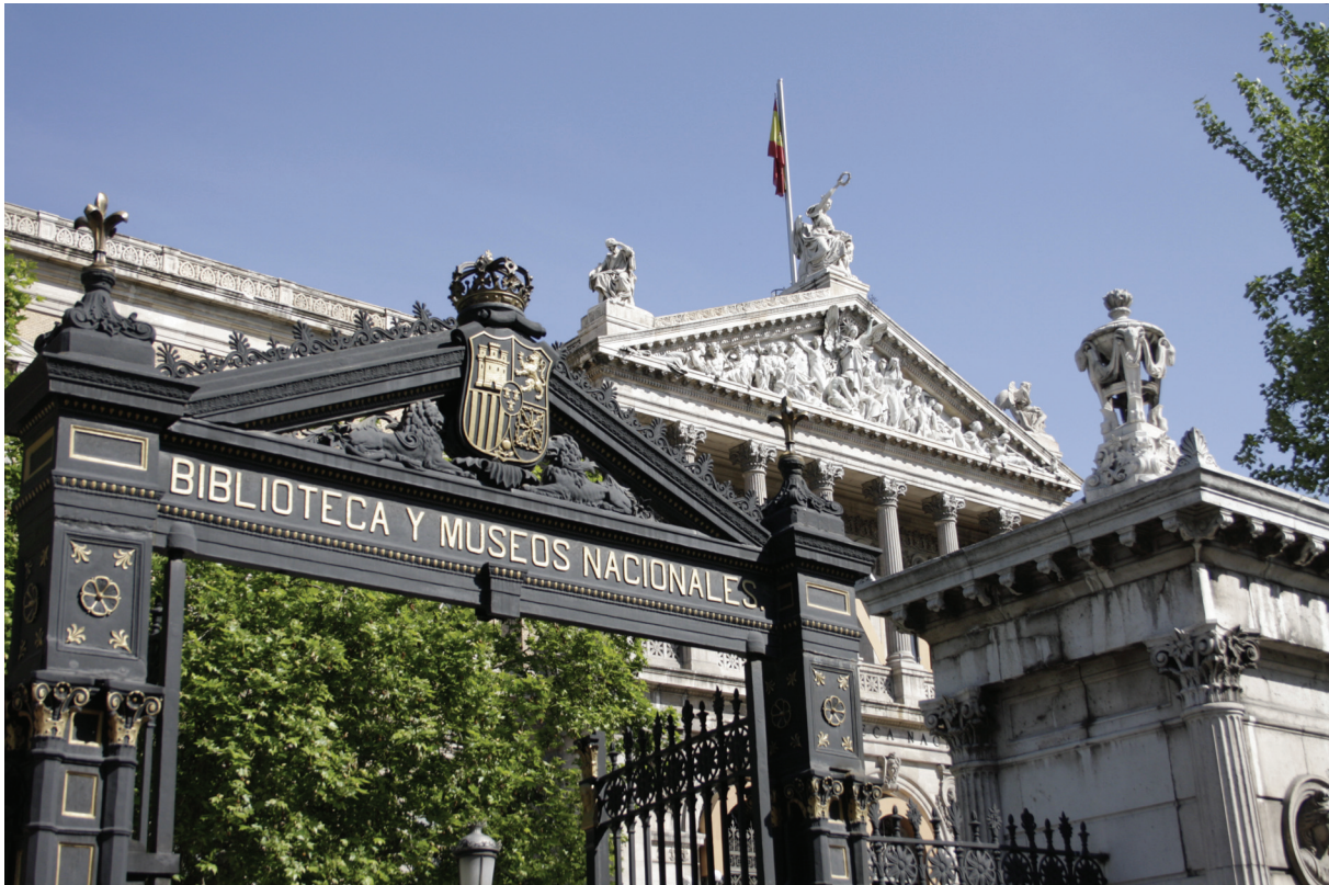
Figure 2: Palace of National Library and Museums ( Palacio de la Biblioteca y Museos Nacionales ), Madrid

Portuguese arrived there, as well as the remains of those ancient civilisations that were extinct at that moment” 2 . The organisers hoped that in so doing, the exhibition would show the current state of progress of Latin America by comparison, underlining “the glory of those who planted there the European civilisation and the peoples who stem from it and who make them blossom” 3 . It was decided that both exhibitions were to be hosted in the Palace of National Library and Museums, a decision that hastened its completion (Bernabéu 1987).