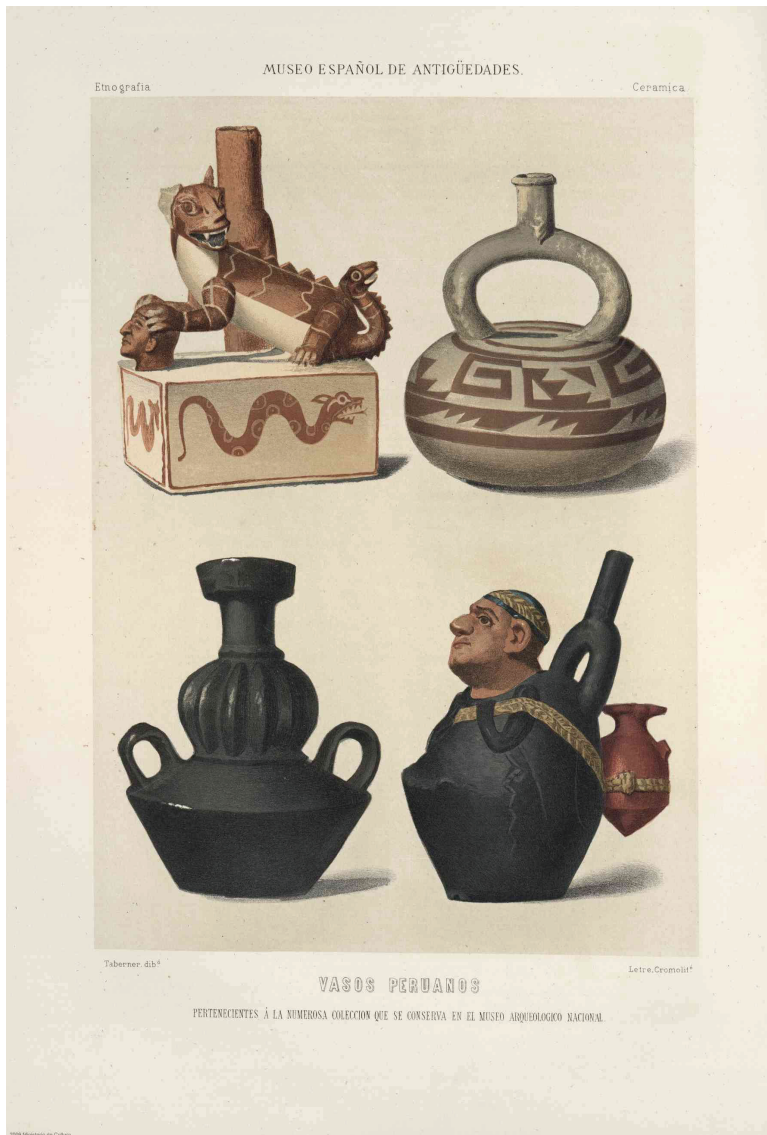
Figure 1: Peruvian antiquities present in the National Archaeological Museum collections in the nineteenth century. Plate published in Janer, F. (1872). "Vasos peruanos del Museo Arqueológico Nacional." Museo Español de Antigüedades 1: 211-218.

Finally, the Ethnographic section received the American collections previously kept at in the Museum of Natural History. These materials were used to contextualise the Spanish / European collections, in the same way that the ethnographic collections were displayed in the French Musée des Antiquités Nationales in Saint-Germain-en-Laye or the Museo Preistorico-etnografico created by Luigi Pigorini in Rome. Unfortunately no visual sources seem to have been preserved of the display of these collections in the first venue of the National Archaeological Museum. Only some engravings in Museo Español de Arqueología , the scientific journal published by the museum provide some images of the pieces.