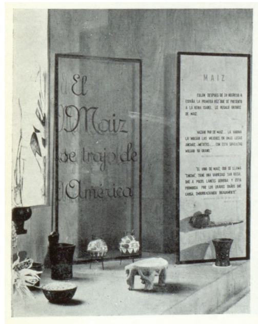
Figure 5: Museum of the Americas, Madrid. Two of the dioramas in Room XI: “Institutions”. Translation of the texts: First diorama “España brought wheat to the Americas”. Second diorama “Maize was brought from the Americas”. Taken from Fernández Vega, P. (1965). Guía del Museo de América , Madrid, Ministerio de Educación Nacional, Dirección General de Bellas Artes.