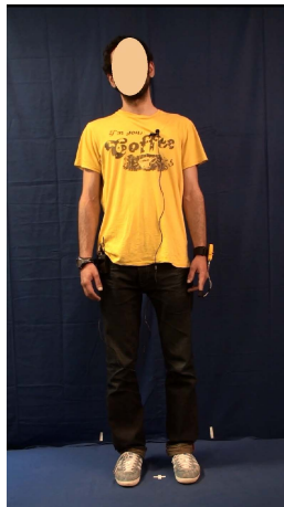
Fig. 2. Frame from a participant's body. The participant is wearing a micro for the voice and a wristwatch for physiological measures. A force plate is hidden under his feet.