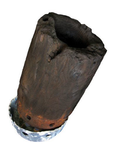
Figure 3: Main mast-step of AB 2's shipwreck. Wooden pump pipe and its strain from the bilge pump. Coll. AB 6/2/67 et AB 6/2/68.