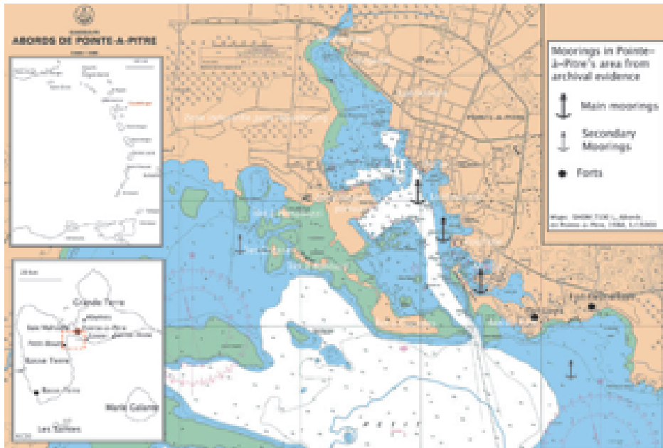
FIGURE 1. GUADELOUPE AND POINTE-À-PITRE'S LOCALIZATION (DRAWING BY AUTHOR, 2010).