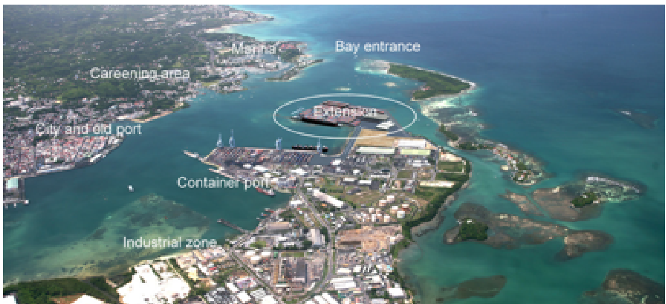
FIGURE 2. PHOTOMONTAGE OF POINTE-À-PITRE BAY AND GUADELOUPEAN PORT AUTHORITY EXTENSION PROJECT, GUADELOUPE PORT AUTHORITY, 2010 (WITH PERMISSION).

Considering the history of the bay, the Guadeloupe Port Authority (GPA) decided to give the Department for Underwater Archaeological Research (DRASSM) the opportunity to organize an underwater archaeological project as part of the expansion of the port. The GPA project plans to increase the surface of the port platform by creating a polder of 0.25 km 2 (25 hectares) for new quays (Figure 2). The objective is to increase