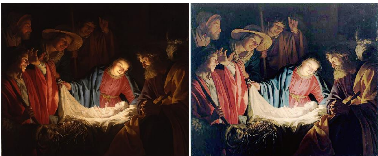
Figure 4: Adoration of the Shepherds, 1622, Wallraf-Richartz-Museum. On the left the original image and, on the right, the combined image. Note the presence of the animals.

The Adoration of the Child is a 1619-1621 oil on canvas. It is in the collection of the Uffizi in Florence. The painting shows Mary laying the Child in white clothes. Joseph is looking over her shoulder and two angels are leaning over the crib. In the image, we see that the Child is the light source, as shown by the faces of the characters. The same happens in the Figure 4.