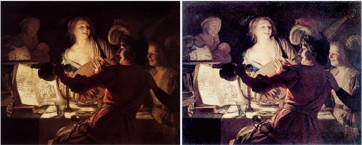
Figure 6: Merry Company, 1623, Staatsgalerie, Schleissheim.