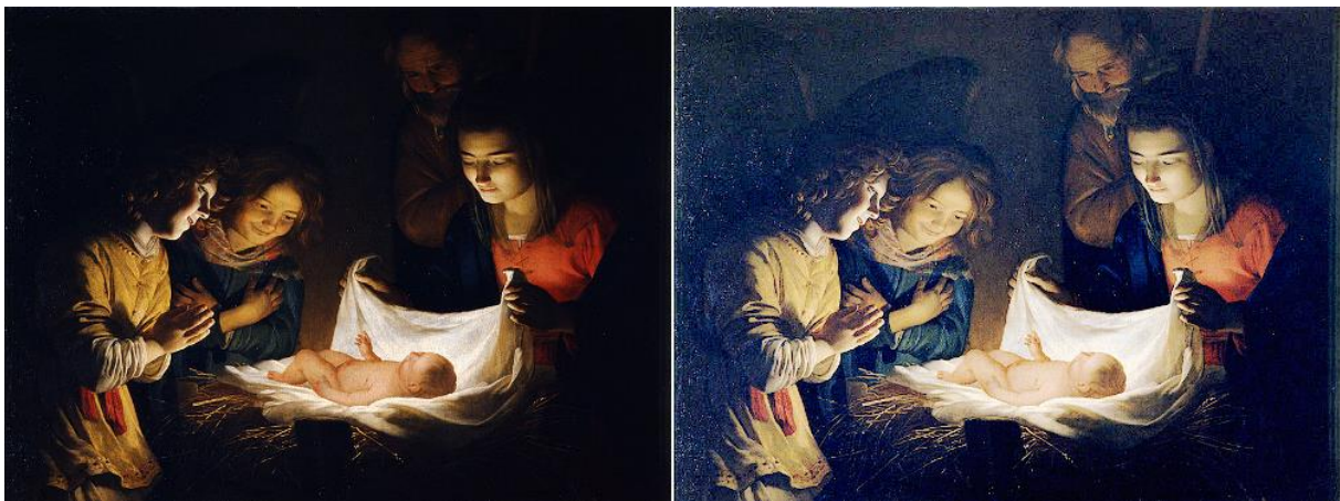
Figure 3: Adoration of the Child. On the left the Wikipedia image and, on the right, the image we obtain combining it with the output of the Retinex filter. Note the wings of the angels.

Here some other examples. In the following figures (Figs. 3-6), we see, on the left, the original digital image that we find in Wikipedia and, on the right, the image we obtain combining the original and the filtered image (as in the example shown in the Figure 2).