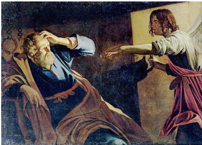
Figure 2: The result of the superposition of the two previous images. Note the chains on the wall behind St. Peter.