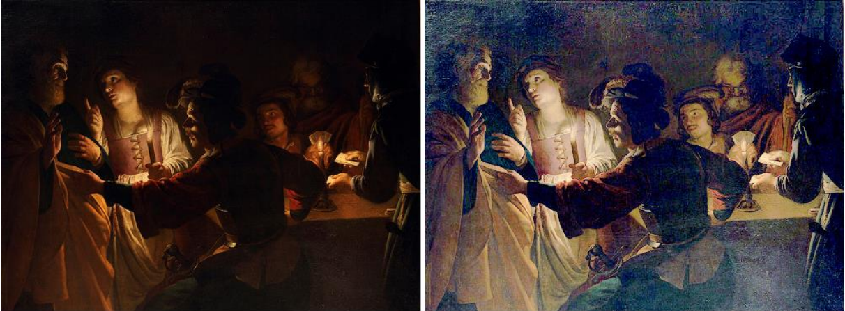
Figure 5: The Denial of Saint Peter, c. 1620. On the left the Wikipedia image and, on the right, the combined image. Two light sources are present in this work, creating two scenes in the same painting.