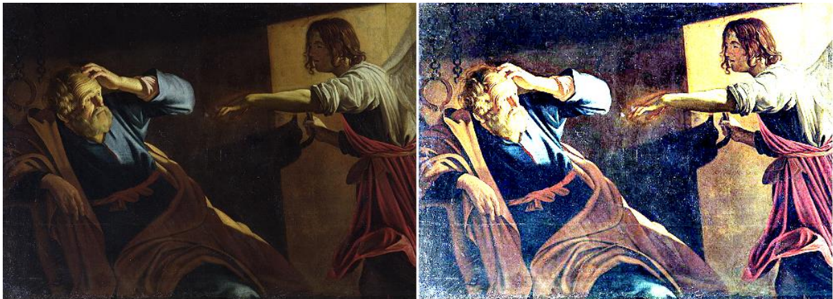
Figure 1: “St. Peter Being Freed from Prison”. Original image on the left; on the right, the output of the GIMP Retinex filter.

The first proposed example of the use of Retinex is exactly the “St. Peter Being Freed from Prison”, 1616-1618, Berlin State Museums. In the Figure 1, we see the original image on the left (it is that we find in Wikipedia, https://en.wikipedia.org/wiki/Gerard_van_Honthorst on January 18, 2017). On the right, we see the image processed by the GIMP Retinex filter, with the values of the parameters chosen as previously told. In the Figure 2, we see the result we can obtain by combining the original image and the filtered image of the Figure 1.