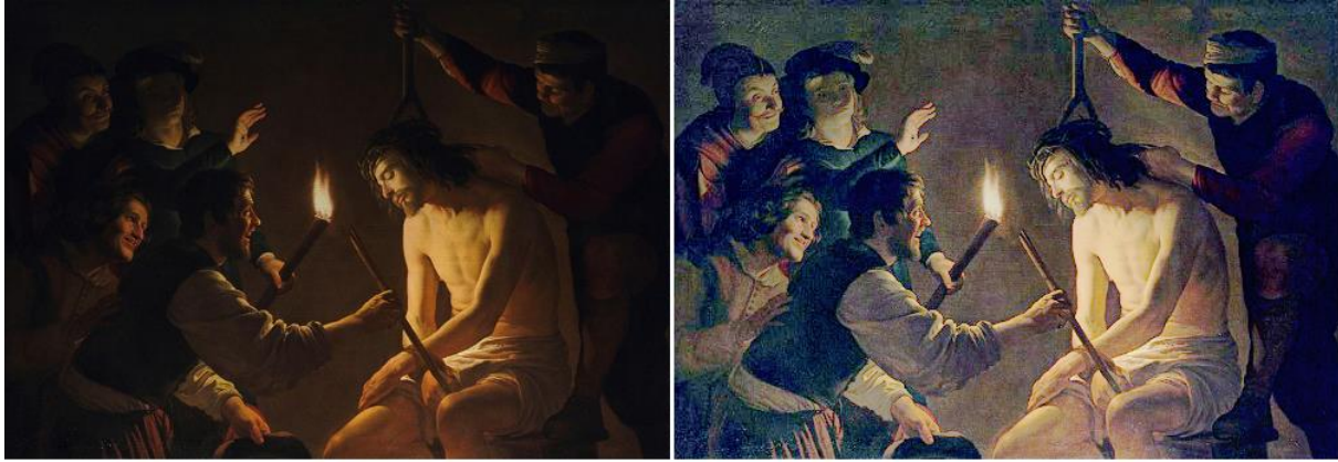
Figure 8: Mocking of Christ.

Let us conclude showing two other examples, where the artist represented two moments of the passion of Jesus Christ. The first shows Christ before the High Priest (Figure 7), and the second shows the Mocking of Christ (Figure 8).