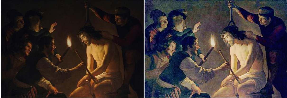
Figure 8: Mocking of Christ.

Let us conclude showing two other examples, where the artist represented two moments of the passion of Jesus Christ. The first shows Christ before the High Priest (Figure 7), and the second shows the Mocking of Christ (Figure 8).