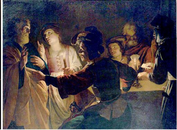
Figure 5: The Denial of Saint Peter, c. 1620. On the left the Wikipedia image and, on the right, the combined image. Two light sources are present in this work, creating two scenes in the same painting.