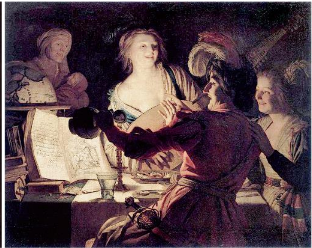
Figure 6: Merry Company, 1623, Staatsgalerie, Schleissheim.