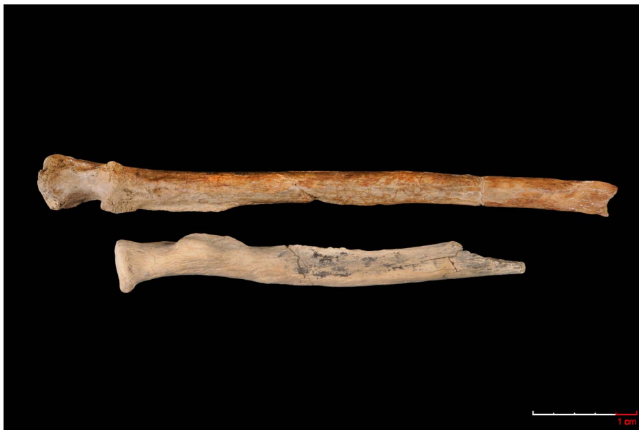
Figure 4. Ulna (OH36) found in upper Bed II and attributed to Paranthropus (upper) compared to the OH80-11 radius (lower).