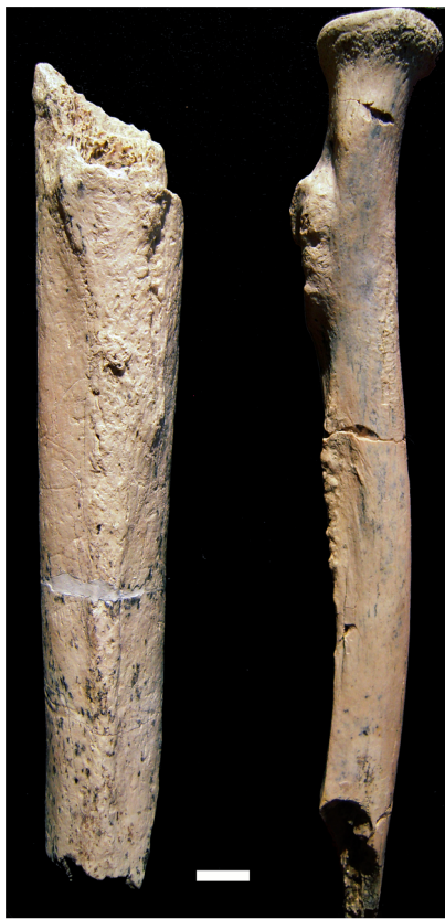
Figure 2. The right femur (OH 80-12; left side of image) and right radius (OH 80-11; right side of image) of the OH 80 hominin from Level 4 at the BK site. Both fossils are shown in posterior view; superior is at the top of the image; the bar scale = 1 cm. doi:10.1371/journal.pone.0080347.g002

The neck is also relatively constricted mediolaterally (14.8 mm), but quite robust anteroposteriorly (19.1 mm). The dimensions of the neck, as well as those of the bicipital tuberosity (maximum superoinferior length = 33.9 mm; maximum transverse width = 19.0 mm), are absolutely and relatively larger than those documented for any other Pliocene and Pleistocene hominin radius specimen [24,25,28,29]. The overall massiveness of OH 80-11, and specifically that of its bicipital tuberosity, suggests that the individual from which the specimen derived possessed large biceps brachii muscles and the ability for application of great strength in forearm flexion. In contrast to the more anteriorly positioned bicipital tuberosities of definitive Homo radii, OH 80-11 shows a more medially placed tuberosity. However, the longitudinal axis of OH 80-11's bicipital tuberosity does not intersect the axis of its interosseous crest, as is common in nonhuman apes and in some Pliocene and Pleistocene hominin radial specimens [30,31]. The longitudinal axis of the interosseous crest of OH 80-11 is posterior to its bicipital tuberosity. Thus, if we are correct in our assignment of OH 80-11 to P. boisei (see below), then, necessarily, the posterior position of this axis in H. sapiens is not an autapomorphy.