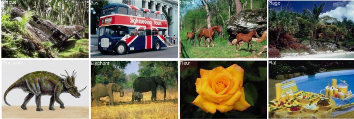
Figure 3. Some examples from the SIMPLicity image database used in the experiments.