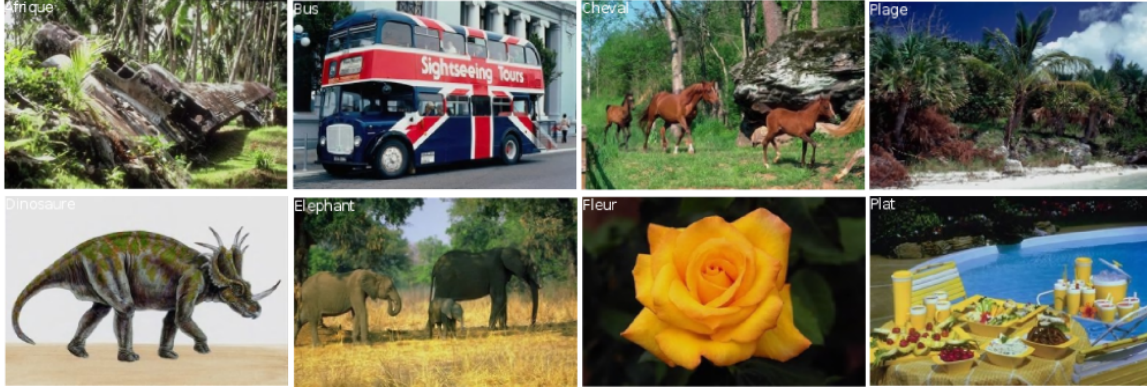
Figure 3. Some examples from the SIMPLicity image database used in the experiments.