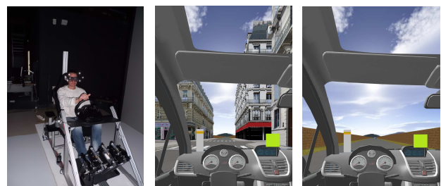
Figure 1: Left: The driving simulator in operation. Center: screenshot of the first part of the simulated environment (urban street). Right: Screenshot of the second part of the simulated environment (field road).

Male (17) or female (11) young drivers with no prior experience in immersive VR setups were tested. Before starting the experimental sessions, each participant performed a training phase in order to stabilize his/her driving performance. This phase