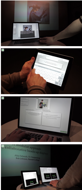
Figure 2: A slideshow controlled with Webstrates [4]. Top to bottom: presenter view, audience view, moderator view, session chair view.

created a number of scenarios that involve multiple interactive surfaces [4], such as a slide presentation with audience participation and session-chair control (Fig. 2). However, more work is needed to better support interactions that involve multiple devices. We also want to extend Webstrates to devices from the internet-of-things that do not support web protocols.