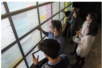
Figure 1: Multi-surface interaction in the WILD Room [2].

are becoming more common. Even in everyday life, such interactive environments are finding their way into shopping malls and airports.