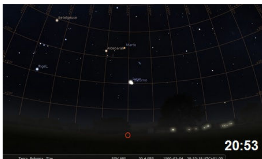
Figure 2: Observation due West (O, Ovest), from Bologna, March 4, 1500. Using Stellarium, we can see the motion of Saturn with respect to the moon. Here in the image, the two bodies are almost coincident.

The two examples shown in the Figures 1 and 2 demonstrate the use of Stellarium for the simulation of astronomical events of which we have location and date, of Julian or Gregorian calendar (in the case the moon is involved, the software CalSKY is useful too). In fact, the simulation can help us in understanding the text written by Copernicus, such as in all the other cases of which we have a detailed description in historical records.