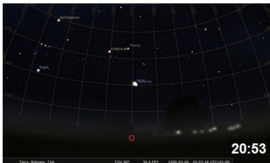
Figure 2: Observation due West (O, Ovest), from Bologna, March 4, 1500. Using Stellarium, we can see the motion of Saturn with respect to the moon. Here in the image, the two bodies are almost coincident.

The two examples shown in the Figures 1 and 2 demonstrate the use of Stellarium for the simulation of astronomical events of which we have location and date, of Julian or Gregorian calendar (in the case the moon is involved, the software CalSKY is useful too). In fact, the simulation can help us in understanding the text written by Copernicus, such as in all the other cases of which we have a detailed description in historical records.