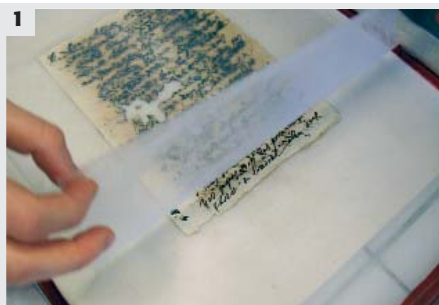
1 Place the document on the screen and cover it with Hollytex ® . Spray the document evenly with water.