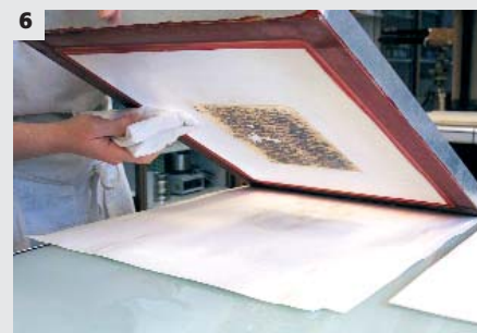
6 After the last bath, lay the screen for some seconds on blotting paper in order to remove excess solution. Gently dry the margins of the verso of the screen with absorbing paper but DO NOT touch the object itself.