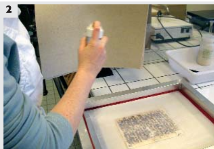
2 The document should not be wet, but simply humidified. To achieve a more even humidification, you could leave the screen with document and Hollytex ® between two moist felts for a couple of minutes.