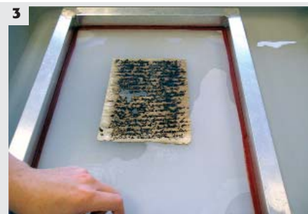
3 Fill the tray with the required amount of solution [1]. Remove felts and Hollytex ® and place the screen in the tray. Ease the screen down slowly to avoid air bubbles being trapped under the screen.