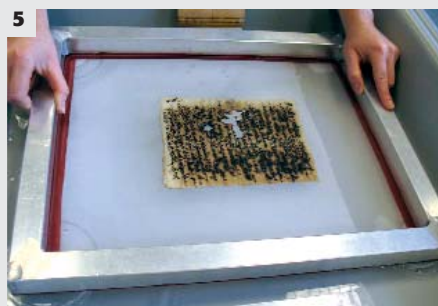
5 The screen can easily be moved from bath to bath. In order to remove excess solution before placing in the next bath, the screen may be laid on blotting paper. DO NOT wipe the verso of the screen as this will disturb the object's placement.