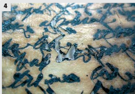
4 The weight of the document pushes the solution through the mesh into the paper by capillarity. Keep the solution agitated from time to time by gently moving a brush in the tray.