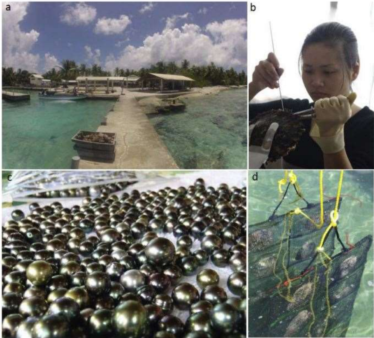
Figure 2. Pearl culture in French Polynesia.

(a) Pearl farm in Rangiroa atoll; (b) Pearl oyster grating: during the grafting process, a small piece of mantle tissue from the donor oyster is inserted into the pearl pocket of the receiving oyster together with a nacre bead, the nucleus; (c) Harvest of colored pearls produced by the pearl oyster Pinctadamargaritifera . (d) Pearl oysters culture after grating. During the first 40 days after the graft, pearl oysters are cultured in retention baskets to assess the rejection of nucleus. (photos Y. Gueguen).