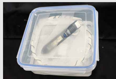
6. Close the box hermetically and wait for at least 4 hours. Check the value displayed by the hygrometer.