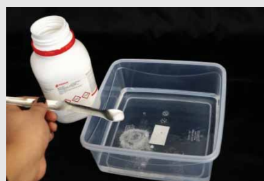
3. Add the selected salt until saturation, i.e. until the salt does not seem to dissolve anymore.