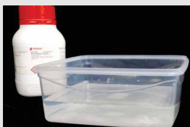
4. Let at rest overnight. If there are still some crystals remaining, the solution is saturated. If not, add some more salt.