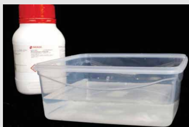
4. Let at rest overnight. If there are still some crystals remaining, the solution is saturated. If not, add some more salt.