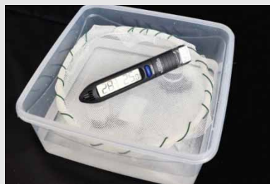
5. Build a non-hermetic support just above the surface of the solution. Place the hygrometer on this support.