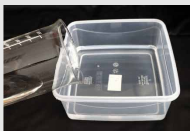
2. Pour the water until it reaches at least one-third of the box height.