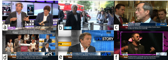
Fig. 3. Examples from REPERE dataset showing the visual variability of broadcast news data.

Parameter training. The CRF model is parameterized by the different \lambda values that express the reliability of each cue in the label inference. They can be learned using labeled training data. However, to avoid data mismatch (at test time, the CRF is conducted on noisy face tracks and utterances, not on cleanly segmented ones) it is important to learn parameters using the segments produced by the mono-modal automatic diarization steps but using the true person labels. Additionally, the data associated to each label and used to train the biometric models will come from the clusters produced by the mono-modal diarizations and will thus be noisy as it will be at test time. Clusters and labels are associated by minimizing the Diarization Error Rate (DER). In other words, the