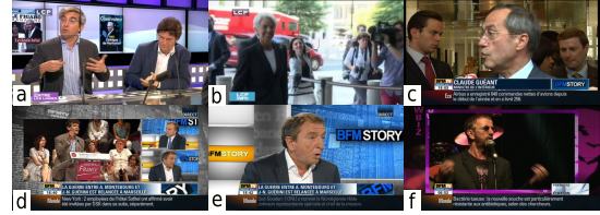
Fig. 3. Examples from REPERE dataset showing the visual variability of broadcast news data.

Parameter training. The CRF model is parameterized by the different \lambda values that express the reliability of each cue in the label inference. They can be learned using labeled training data. However, to avoid data mismatch (at test time, the CRF is conducted on noisy face tracks and utterances, not on cleanly segmented ones) it is important to learn parameters using the segments produced by the mono-modal automatic diarization steps but using the true person labels. Additionally, the data associated to each label and used to train the biometric models will come from the clusters produced by the mono-modal diarizations and will thus be noisy as it will be at test time. Clusters and labels are associated by minimizing the Diarization Error Rate (DER). In other words, the