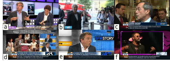
Fig. 3. Examples from REPERE dataset showing the visual variability of broadcast news data.

Parameter training. The CRF model is parameterized by the different \lambda values that express the reliability of each cue in the label inference. They can be learned using labeled training data. However, to avoid data mismatch (at test time, the CRF is conducted on noisy face tracks and utterances, not on cleanly segmented ones) it is important to learn parameters using the segments produced by the mono-modal automatic diarization steps but using the true person labels. Additionally, the data associated to each label and used to train the biometric models will come from the clusters produced by the mono-modal diarizations and will thus be noisy as it will be at test time. Clusters and labels are associated by minimizing the Diarization Error Rate (DER). In other words, the