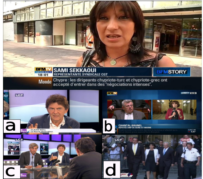
Fig. 1. Example frames from the REPERE corpus showing the variety of the visual conditions: pose, camera viewpoint, illumination, and the name face association challenges: multi face images (image b) and name propagation (from a to c).

In this paper, we propose an approach to identify faces using overlaid person names (OPNs) extracted by OCR techniques. These OPNs are used to introduce the most important people in the videos, like journalists and guests as illustrated in Fig. 1, making them very appealing [8, 7]: their extraction is much more reliable than pronounced names ob-