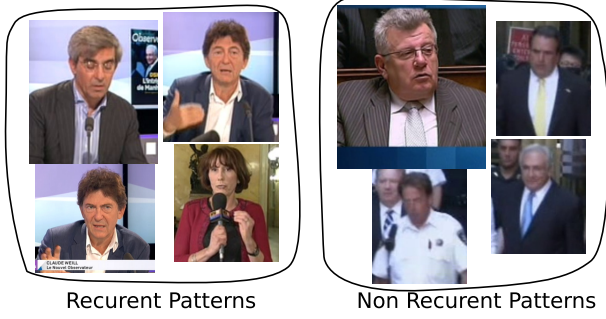
Fig. 3. The persons on the left are actually announced by an OPN, whereas the persons on the right are non-talking figurative people. (see Fig 1 for the full images)