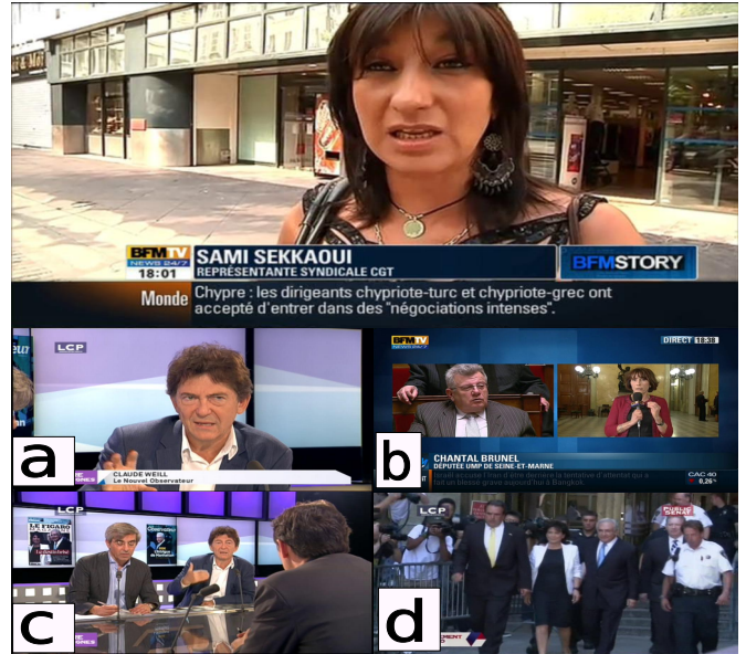
Fig. 1. Example frames from the REPERE corpus showing the variety of the visual conditions: pose, camera viewpoint, illumination, and the name face association challenges: multi face images (image b) and name propagation (from a to c).

In this paper, we propose an approach to identify faces using overlaid person names (OPNs) extracted by OCR techniques. These OPNs are used to introduce the most important people in the videos, like journalists and guests as illustrated in Fig. 1, making them very appealing [8, 7]: their extraction is much more reliable than pronounced names ob-