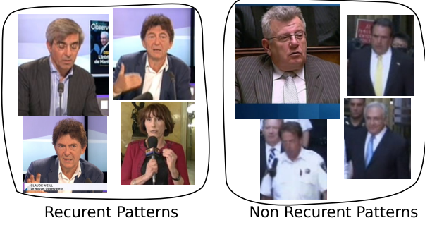
Fig. 3. The persons on the left are actually announced by an OPN, whereas the persons on the right are non-talking figurative people. (see Fig 1 for the full images)