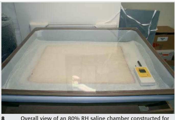
Overall view of an 80% RH saline chamber constructed for flattening documents.

The DMT has been designed for evaluating the risk of Fe(II) migration during a local repair using a water-based adhesive, and gives satisfactory results. Additional applications of this test were evaluated in this research. It appears to be unsuitable for assessing the risk of Fe(II) migration during an alcohol treatment and during a water immersion. Similarly, intermediate treatments in which soluble products can be extracted in a solvent (floating, vacuum table, etc.) cannot be reliably evaluated with this test. In all these cases, it is more appropriate to refer to the observation of original samples when assessing the migration risk. It could also be interesting to develop a variant of the