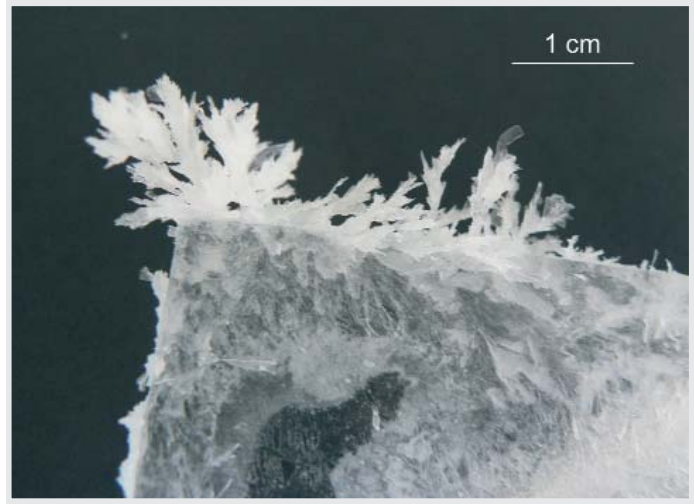
7 Example of crystal growth of ammonium sulphate, (NH_4)_2 \cdot SO_{4^{\prime}} appearing on a glass plate after three weeks in an 80% RH saline chamber with no cleaning.

one condition to another occurred in about 2 minutes. These tests were first carried out on loose DMT sheets to simulate individual documents. Tests were then duplicated on DMT sheets placed in the middle of a bundle of one hundred sheets of Whatman paper held on one side by a large clip in order to simulate the case of an archival bundle. No migration of Fe(II) was found in either case.