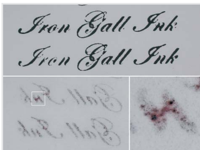
1 The DMT. Front (top) and back (bottom). Small pink traces are visible on the verso indicating that bathophenanthroline reacts with available Fe(II) ions during the application of the ink.

Bathophenanthroline (Sigma Aldrich) is a colourless compound, which reacts with Fe(II), and to a lesser extent with Fe(III), to form several types of chelated species. The 1:3 Fe(II)-bathophenanthroline chelate is the best known: unlike the other chelates that are colourless, it has a characteristic fuchsia pink