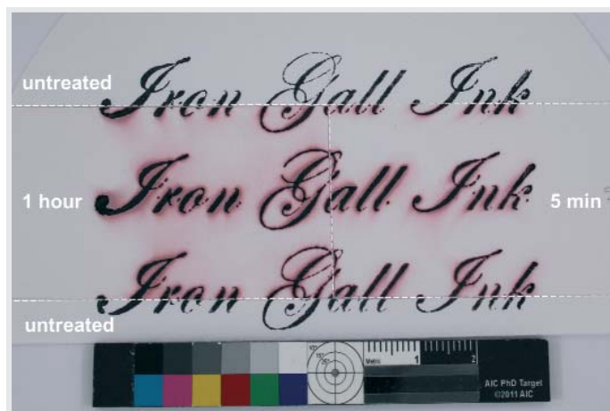
2 DMT water immersion test. The upper and lower parts were kept separate as controls and not treated. The centre-right part was immersed for 5 minutes. The centre-left part was immersed for 1 hour.

It would appear more appropriate to assess the risks of Fe(II) migration with ethanol by directly applying bathophenanthroline paper strips (BPS) to original documents in a fairly similar way to identifying iron gall inks (Neevel 2009; Neevel and Reissland 2005), but using ethanol instead of water. Fundamentally, the pink colour indicates the ability of Fe(II) ions to be dissolved by the solvent and to migrate from the original ink to the BPS. In this respect, the BPS is not only a test of identification, but can also be seen as a test of solubility. In this project the BPS test was applied to a large range of original manuscripts, mostly causing the appearance of a pink colour with water, but not with alcohol. With original inks, the risk of migration of Fe(II) is therefore greater with water than with ethanol, which is consistent with observations of original documents after treatment (Martin 2011). Although instructive, the BPS test should be considered with great care when evaluating the effects of solvents other than