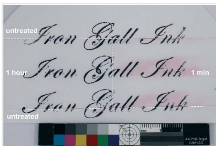
3 Additional water immersion test. The upper and lower parts were kept separate as controls and not treated. The centre-right part was immersed for one minute. The centre-left part was immersed for one hour. Bathophenanthroline was sprayed after immersion (not before).

This point can be demonstrated with test samples stamped