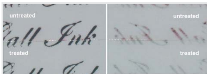
4 Risk of Fe(II) migration related to the calcium phytate treatment. The upper part was kept separate as a control and the lower part underwent the full calcium phytate treatment. Bathophenanthroline was sprayed after immersion (not before).

Several methods are available to achieve a specific relative humidity. One uses a silica gel that corresponds to the desired humidity range. Some give satisfactory results in the range 70-90% RH (gel type M: Long Life for Art). Silica gel has the advantage of generating vapour without causing micro-droplets, but