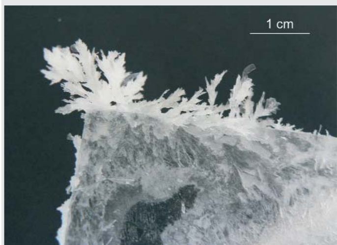
7 Example of crystal growth of ammonium sulphate, (NH 4 ) 2 SO 4 , appearing on a glass plate after three weeks in an 80% RH saline chamber with no cleaning.