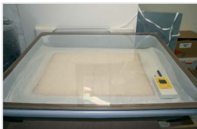
8 Overall view of an 80% RH saline chamber constructed for flattening documents.